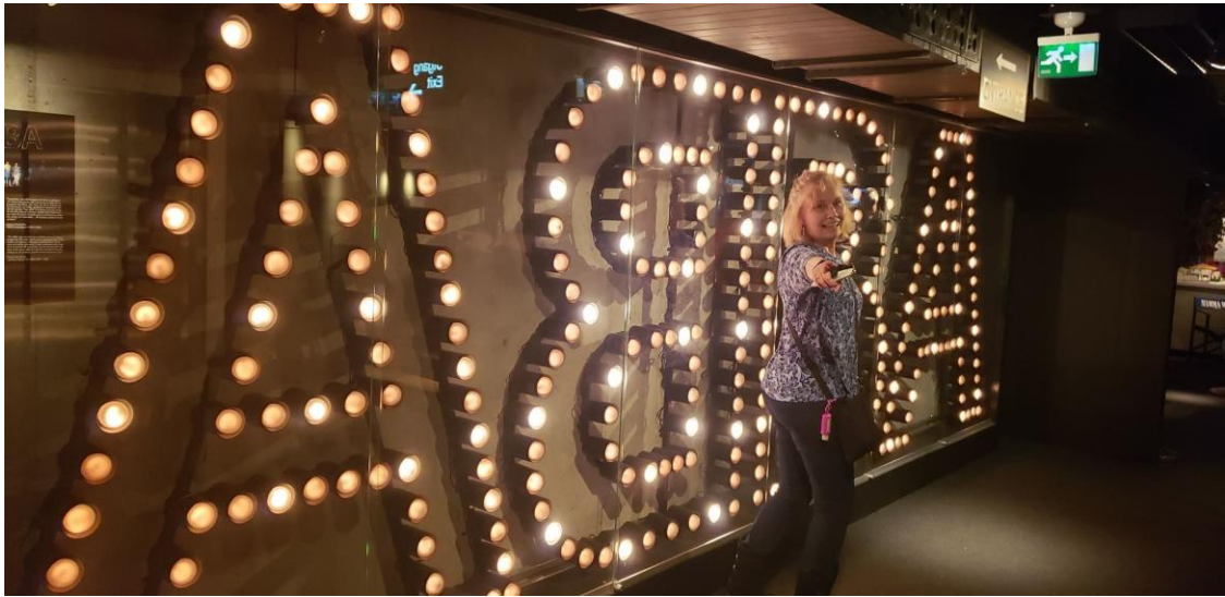
This ABBA wall was made for photo ops. Do your best pose!