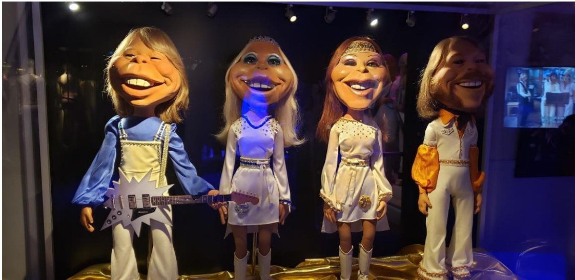
I thought these funny little ABBA guys were cute.