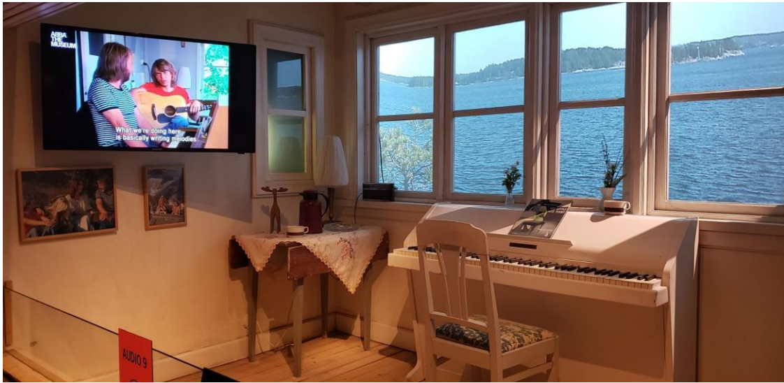
Björn and Benny made their music in this replica cabin with a view of the Stockholm Archipelago.